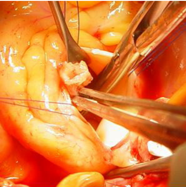
Figure 1. Aortic valve was exited, debritman was performed for paravalvular abscess and necrotic tissue was removed.

21 years old male patient was undergone aortic root enlarge-